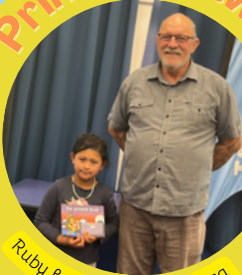
Ruby for Whanaungatanga