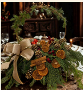
TABLE CENTRE PIECE Saturday 22nd Nov 10am - 12pm Sunday 30th Nov 2pm - 4pm

Join me for some festive fun, creativity and light refreshments while creating your masterpiece