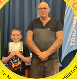
Te Ngahere for showing resilience