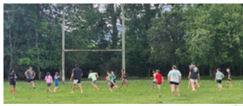
A bit of fun at the local Touch game last night