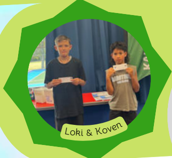
Loki & Koven

Te Kaia for consistently showing the school value of Whanaungatanga