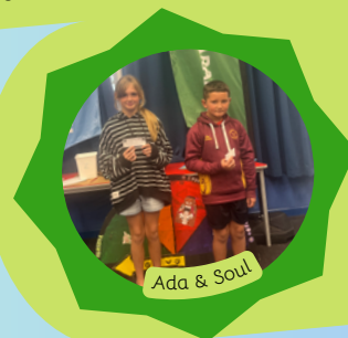
Ada & Soul