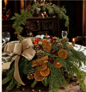
TABLE CENTRE PIECE Saturday 22nd Nov 10am - 12pm Sunday 30th Nov 2pm - 4pm

Join me for some festive fun, creativity and light refreshments while creating your masterpiece